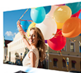
SuperColor™ projectors offer color accuracy levels

ViewSonic's exclusive SuperColor™ Technology delivers superior colour range than competitor projectors, ensuring that users enjoy more realistic and accurate colours. With an exclusive colour wheel design and dynamic lamp control capabilities, SuperColor™ Technology projects images with true-to-life colour performance in all scenarios, also reducing eye fatigue in bright and dark images.