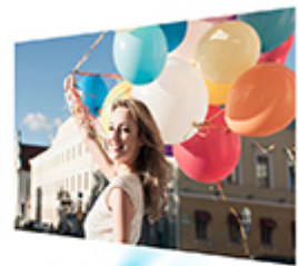
Conventional projectors offer low-quality images