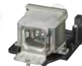
LMP-E212 Projector Lamp (for replacement)